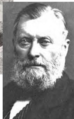
William Edward Forster