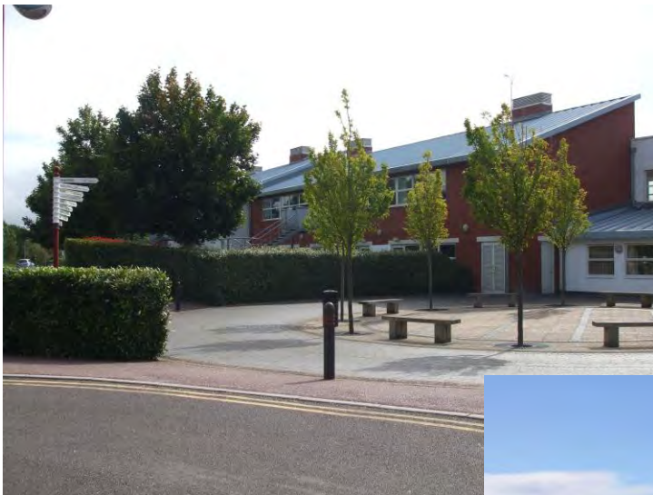
Sir John Colfox School

Bradpole does have the town's secondary school, the Sir John Colfox School, within its boundary, as well the Gore Cross Business Park and St Catherine's Roman Catholic Primary School.