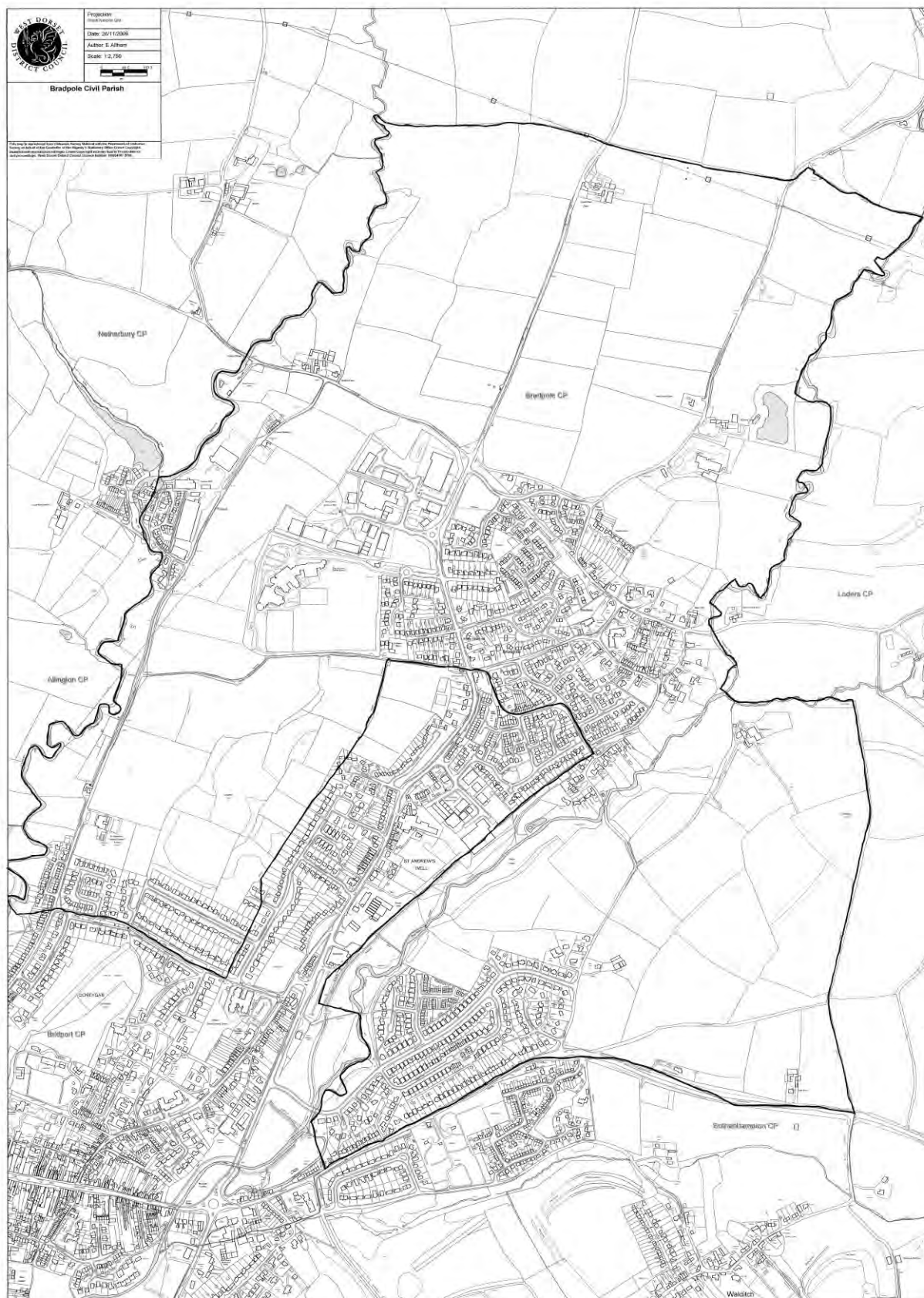
Bradpole Civil Parish Boundaries