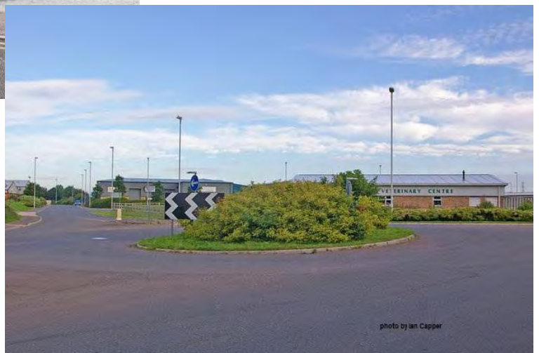
Gore Cross Business Park