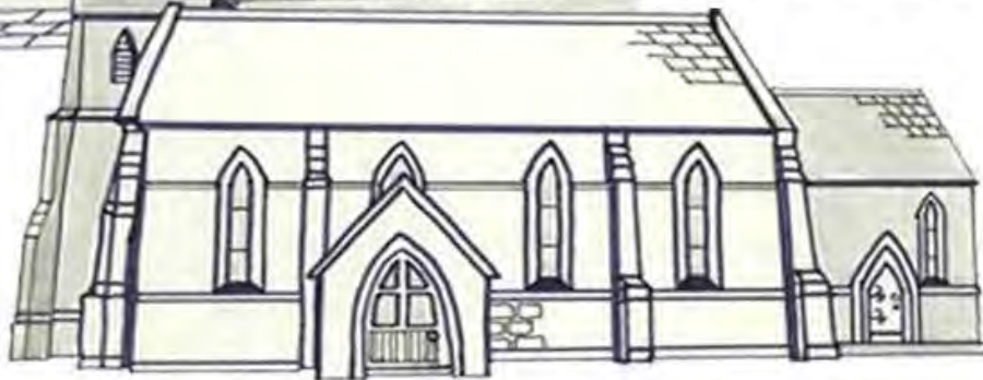
HOLY TRINITY CHURCH