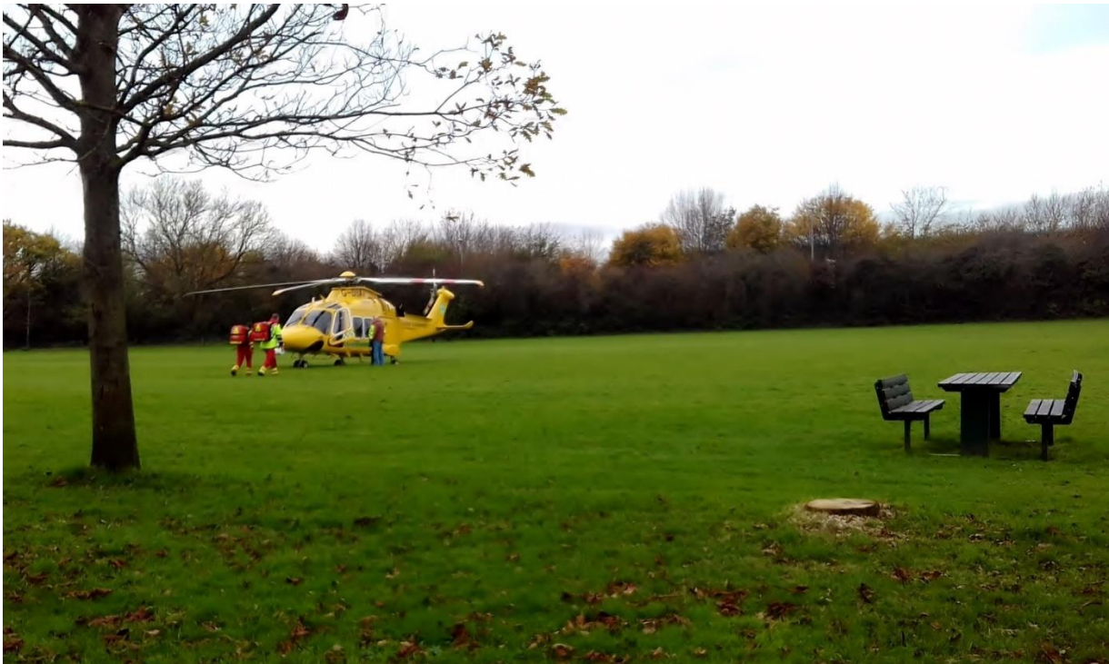
Air Ambulance at Gore Cross Recreation Ground