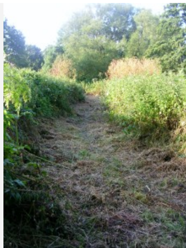
The footpath behind Willow Way July 2016

This responsibility has lain with the County Council for several years. Recent expenditure cutbacks have resulted in a reduction in the level of maintenance. Unfortunately the vegetation has no concept of financial pruning and continues to grow.